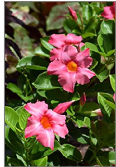
Madinia Coral Pink Mandevilla flowers

This plant does best in full sun to partial shade. It requires an evenly moist well-drained soil for optimal growth. It is not particular as to soil type or pH. It is highly tolerant of urban pollution and will even thrive in inner city environments. This particular variety is an interspecific hybrid, and parts of it are known to be toxic to humans and animals, so care should be exercised in planting it around children and pets. It can be propagated by cuttings; however, as a cultivated variety, be aware that it may be subject to certain restrictions or prohibitions on propagation.