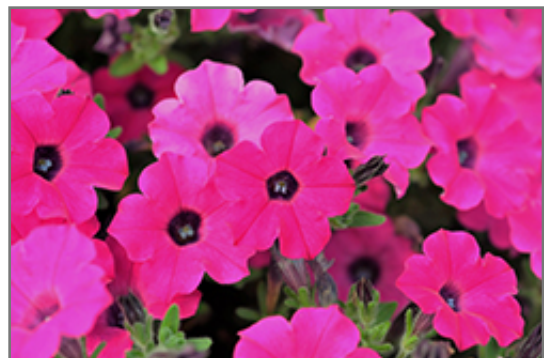
Itsy Magenta Petunia flowers