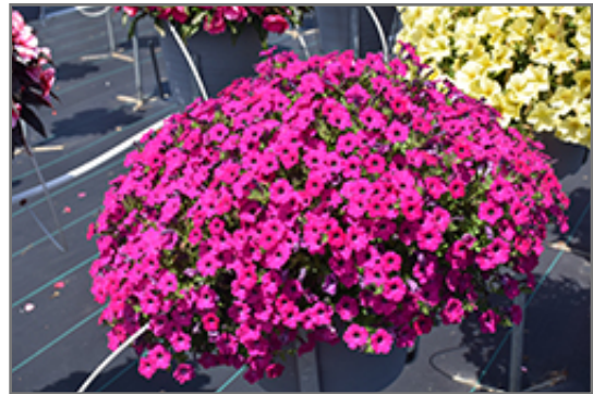
Itsy Magenta Petunia in bloom