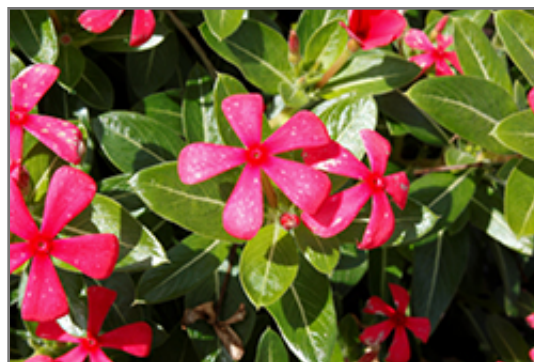
Soiree Kawaii Red Shades Vinca flowers

Soiree Kawaii Red Shades Vinca is a dense herbaceous annual with a trailing habit of growth, eventually spilling over the edges of hanging baskets and containers. Its medium texture blends into the garden, but can always be balanced by a couple of finer or coarser plants for an effective composition.