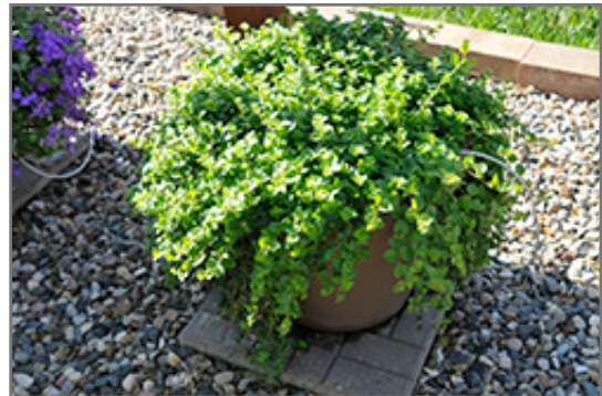
Indian Mint