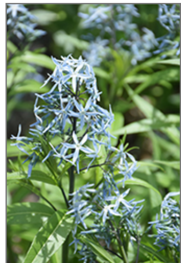
Narrow-Leaf Blue Star flowers