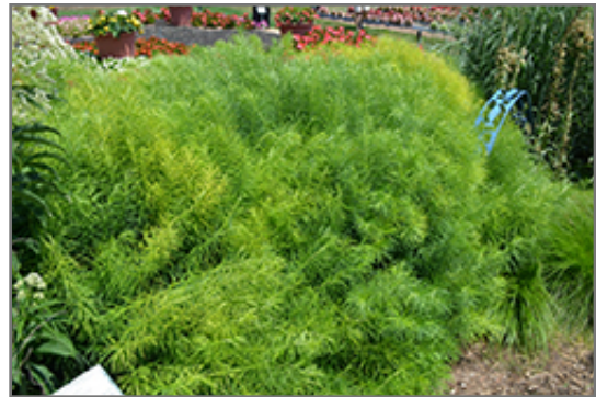
Narrow-Leaf Blue Star

Narrow-Leaf Blue Star will grow to be about 24 inches tall at maturity, with a spread of 24 inches. Its foliage tends to remain dense right to the ground, not requiring facer plants in front. It grows at a slow rate, and under ideal conditions can be expected to live for approximately 20 years. As an herbaceous perennial, this plant will usually die back to the crown each winter, and will regrow from the base each spring. Be careful not to disturb the crown in late winter when it may not be readily seen!