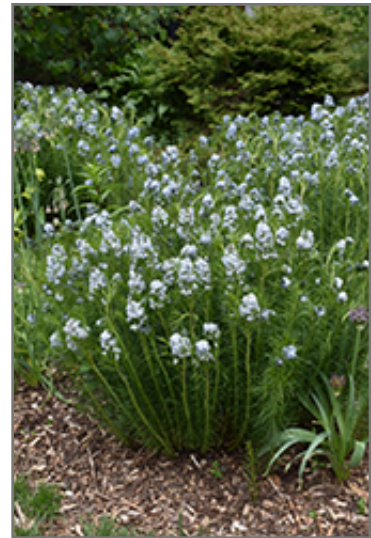
Narrow-Leaf Blue Star in bloom

This is a relatively low maintenance plant, and should be cut back in late fall in preparation for winter. Deer don't particularly care for this plant and will usually leave it alone in favor of tastier treats. It has no significant negative characteristics.