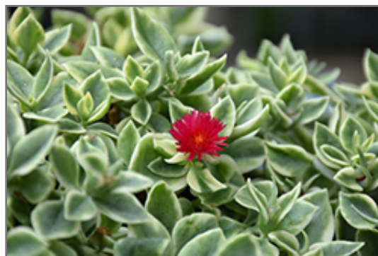
Variegated Baby Sun Rose flowers

Variegated Baby Sun Rose is recommended for the following landscape applications;