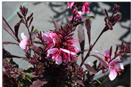
Bantam Pink Gaura flowers