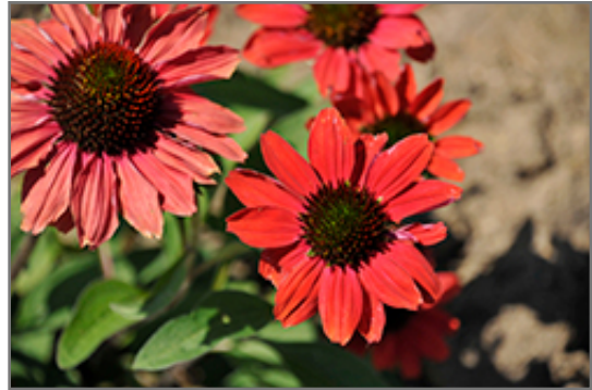
Color Coded Frankly Scarlet Coneflower flowers