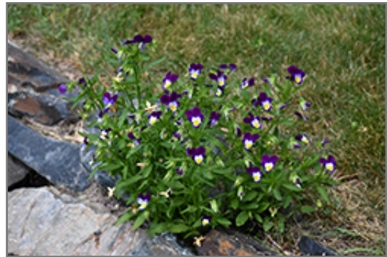
Johnny Jump-Up in bloom

Johnny Jump-Up will grow to be only 4 inches tall at maturity extending to 6 inches tall with the flowers, with a spread of 6 inches. When grown in masses or used as a bedding plant, individual plants should be spaced approximately 5 inches apart. It grows at a fast rate, and tends to be biennial, meaning that it puts on vegetative growth the first year, flowers the second, and then dies. However, this species tends to self-seed and will thereby endure for years in the garden if allowed. As an herbaceous perennial, this plant will usually die back to the crown each winter, and will regrow from the base each spring. Be careful not to disturb the crown in late winter when it may not be readily seen!