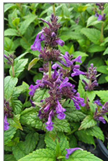
Neptune Catmint flowers