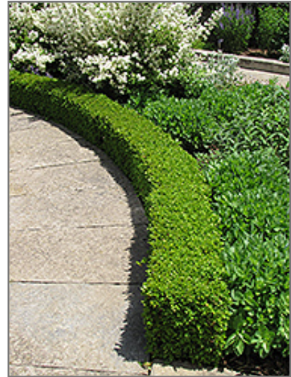
Green Velvet Boxwood

Green Velvet Boxwood makes a fine choice for the outdoor landscape, but it is also well-suited for use in outdoor pots and containers. Because of its height, it is often used as a 'thriller' in the 'spiller-thriller-filler' container combination; plant it near the center of the pot, surrounded by smaller plants and those that spill over the edges. It is even sizeable enough that it can be grown alone in a suitable container. Note that when grown in a container, it may not perform exactly as indicated on the tag - this is to be expected. Also note that when growing plants in outdoor containers and baskets, they may require more frequent waterings than they would in the yard or garden.