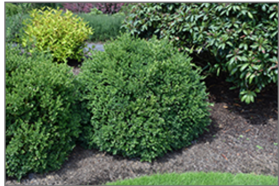
Green Velvet Boxwood