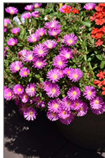
Ocean Sunset Violet Ice Plant flowers