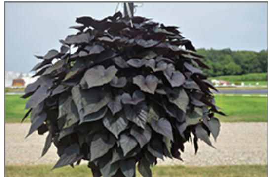
Floramia Cameo Sweet Potato Vine

Floramia Cameo Sweet Potato Vine is recommended for the following landscape applications;