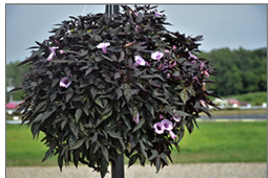
Floramia Cameo Sweet Potato Vine