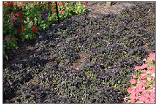
Floramia Cameo Sweet Potato Vine in bloom

Floramia Cameo Sweet Potato Vine will grow to be about 8 inches tall at maturity, with a spread of 24 inches. When grown in masses or used as a bedding plant, individual plants should be spaced approximately 20 inches apart. Its foliage tends to remain low and dense right to the ground. This fast-growing annual will normally live for one full growing season, needing replacement the following year.