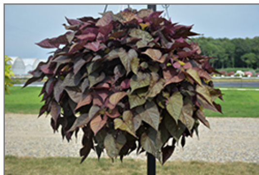
Floramia Rosso Sweet Potato Vine

Floramia Rosso Sweet Potato Vine is recommended for the following landscape applications;