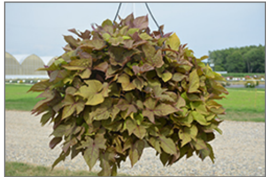
Floramia Verdino Sweet Potato Vine

Floramia Verdino Sweet Potato Vine will grow to be about 8 inches tall at maturity, with a spread of 24 inches. When grown in masses or used as a bedding plant, individual plants should be spaced approximately 20 inches apart. Its foliage tends to remain low and dense right to the ground. This fast-growing annual will normally live for one full growing season, needing replacement the following year.