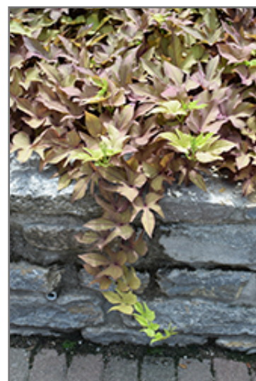
Floramia Verdino Sweet Potato Vine