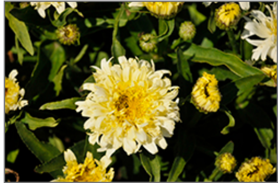
Ice Cream Dream Shasta Daisy flowers