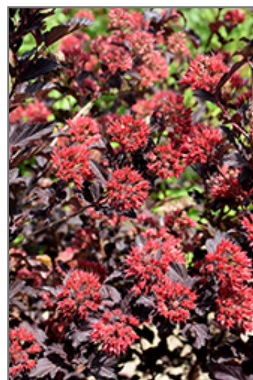
Center Glow Ninebark fruit