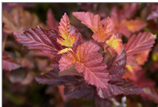
Center Glow Ninebark foliage

Center Glow Ninebark is recommended for the following landscape applications;