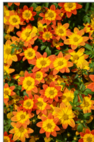
Blazing Glory Bidens flowers

This is a relatively low maintenance plant, and should not require much pruning, except when necessary, such as to remove dieback. It is a good choice for attracting bees and butterflies to your yard. It has no significant negative characteristics.