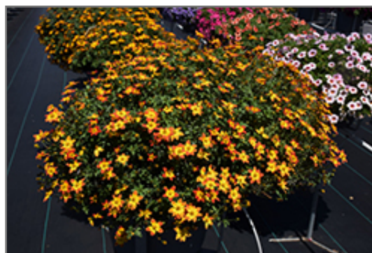
Blazing Glory Bidens in bloom