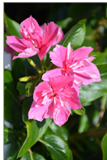
Soiree Double Pink Vinca flowers

Soiree Double Pink Vinca is a dense herbaceous annual with a trailing habit of growth, eventually spilling over the edges of hanging baskets and containers. Its medium texture blends into the garden, but can always be balanced by a couple of finer or coarser plants for an effective composition.