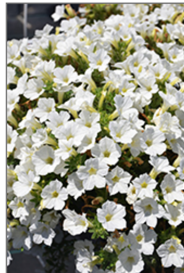
Itsy White Petunia flowers

Itsy White Petunia is a dense herbaceous annual with a trailing habit of growth, eventually spilling over the edges of hanging baskets and containers. Its medium texture blends into the garden, but can always be balanced by a couple of finer or coarser plants for an effective composition.