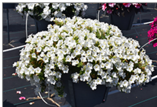
Itsy White Petunia in bloom