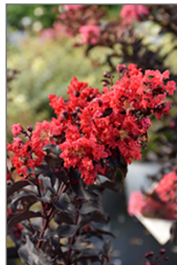
Center Stage Red Crapemyrtle flowers

Center Stage Red Crapemyrtle is recommended for the following landscape applications;