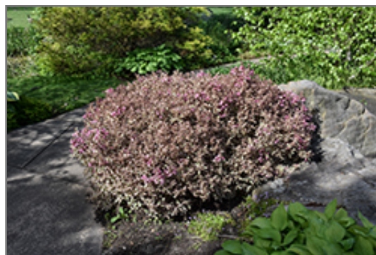
My Monet Purple Effect Weigela in bloom