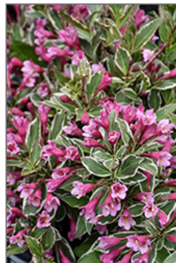
My Monet Purple Effect Weigela flowers

My Monet Purple Effect Weigela is recommended for the following landscape applications;