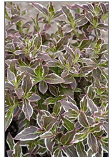
My Monet Purple Effect Weigela foliage