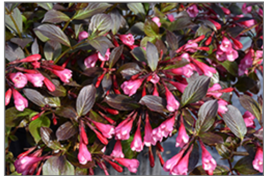
Very Fine Wine Weigela flowers

Very Fine Wine Weigela is recommended for the following landscape applications;