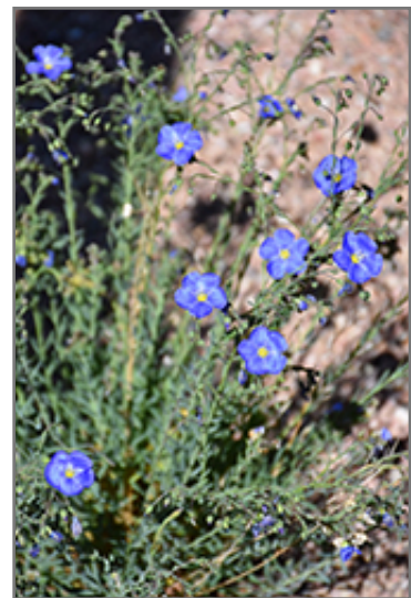
Wild Blue Flax flowers