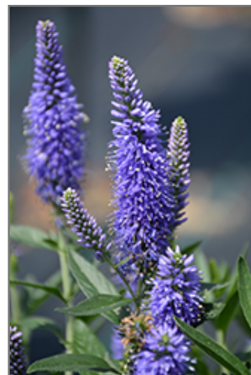
Skyward Blue Long-leaf Speedwell flowers

Skyward Blue Long-leaf Speedwell is a fine choice for the garden, but it is also a good selection for planting in outdoor pots and containers. It is often used as a 'filler' in the 'spiller-thriller-filler' container combination, providing a mass of flowers against which the larger thriller plants stand out. Note that when growing plants in outdoor containers and baskets, they may require more frequent waterings than they would in the yard or garden.