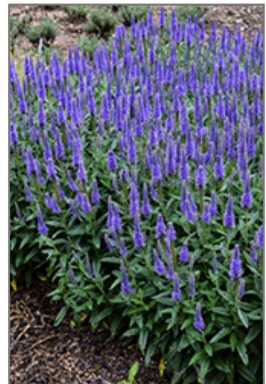
Skyward Blue Long-leaf Speedwell in bloom