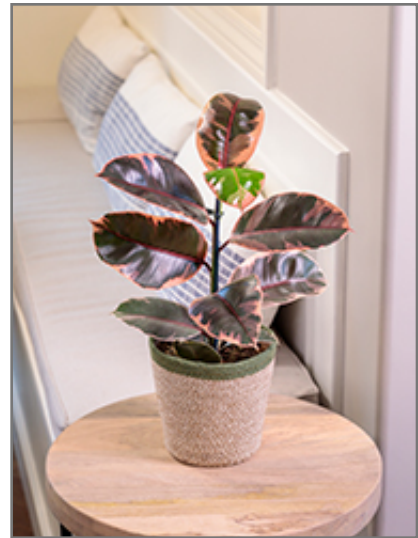
Chroma Belize Rubber Plant in full

When grown indoors, Chroma Belize Rubber Plant can be expected to grow to be about 8 feet tall at maturity, with a spread of 4 feet. It grows at a medium rate, and under ideal conditions can be expected to live for approximately 50 years. This houseplant will do well in a location that gets either direct or indirect sunlight, although it will usually require a more brightly-lit environment than what artificial indoor lighting alone can provide. It does best in average to evenly moist soil, but will not tolerate standing water. The surface of the soil shouldn't be allowed to dry out completely, and so you should expect to water this plant once and possibly even twice each week. Be aware that your particular watering schedule may vary depending on its location in the room, the pot size, plant size and other conditions; if in doubt, ask one of our experts in the store for advice. It will benefit from a regular feeding with a general-purpose fertilizer with every second or third watering. It is not particular as to soil pH, but grows best in rich soil. Contact the store for specific recommendations on pre-mixed potting soil for this plant. Be warned that parts of this plant are known to be toxic to humans and animals, so special care should be exercised if growing it around children and pets.