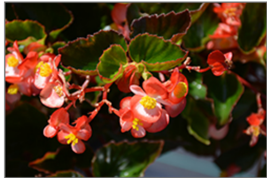
Hula Bicolor Red White Begonia flowers

Hula Bicolor Red White Begonia is a fine choice for the garden, but it is also a good selection for planting in outdoor containers and hanging baskets. Because of its spreading habit of growth, it is ideally suited for use as a 'spiller' in the 'spiller-thriller-filler' container combination; plant it near the edges where it can spill gracefully over the pot. Note that when growing plants in outdoor containers and baskets, they may require more frequent waterings than they would in the yard or garden.