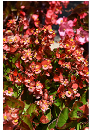
Hula Bicolor Red White Begonia flowers

Hula Bicolor Red White Begonia is an herbaceous annual with a ground-hugging habit of growth. Its medium texture blends into the garden, but can always be balanced by a couple of finer or coarser plants for an effective composition.