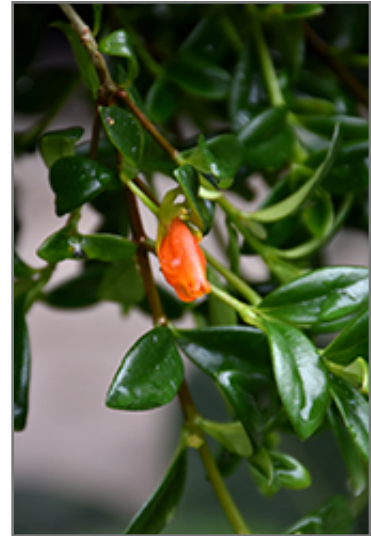
Goldfish Plant flowers

This is a dense herbaceous evergreen houseplant with a trailing habit of growth, eventually spilling over the edges of hanging baskets and containers. This plant can be pruned at any time to keep it looking its best.