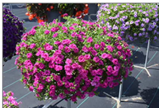
MiniFamous Neo Double Purple Calibrachoa in bloom