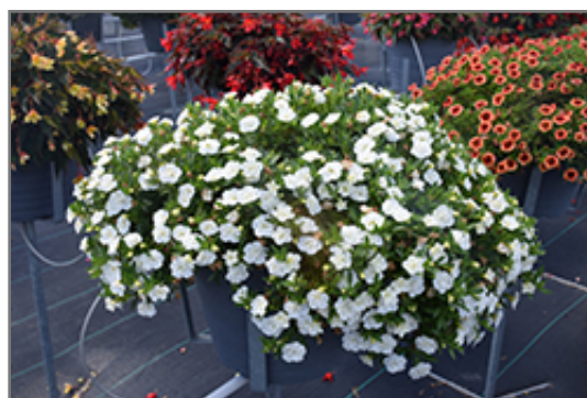
MiniFamous Neo Double White Calibrachoa in bloom