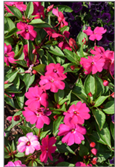
Solarscape Magenta Bliss Impatiens flowers

Solarscape Magenta Bliss Impatiens is recommended for the following landscape applications;