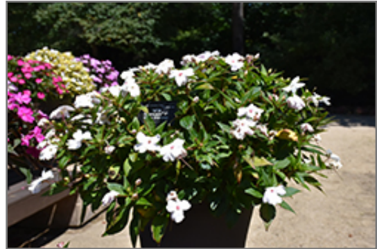
Solarscape White Shimmer Impatiens in bloom

Solarscape White Shimmer Impatiens will grow to be about 9 inches tall at maturity, with a spread of 20 inches. When grown in masses or used as a bedding plant, individual plants should be spaced approximately 14 inches apart. Its foliage tends to remain low and dense right to the ground. This fast-growing annual will normally live for one full growing season, needing replacement the following year.