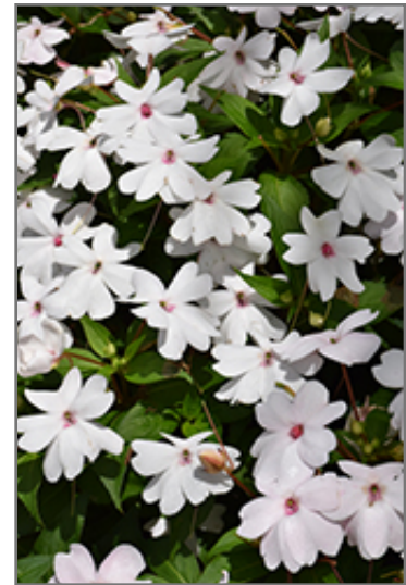
Solarscape White Shimmer Impatiens flowers

Solarscape White Shimmer Impatiens is recommended for the following landscape applications;