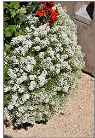
Easy Breezy White Lobularia flowers

Easy Breezy White Lobularia is recommended for the following landscape applications;