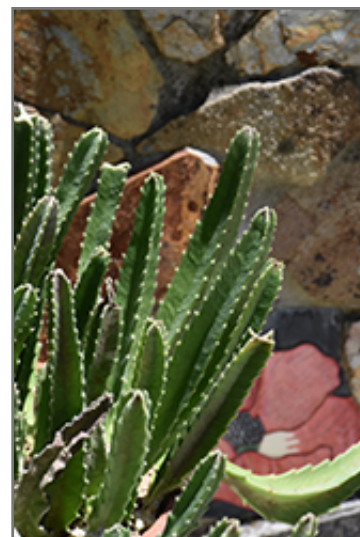
Zulu Giant

This plant will require occasional maintenance and upkeep, and is best cleaned up in early spring before it resumes active growth for the season. Gardeners should be aware of the following characteristic(s) that may warrant special consideration;