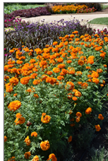
Xochi Orange Marigold in bloom