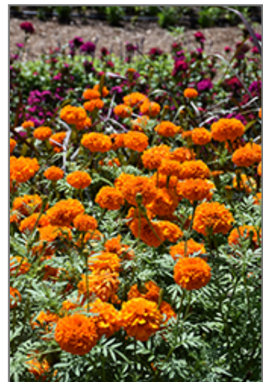
Xochi Orange Marigold flowers