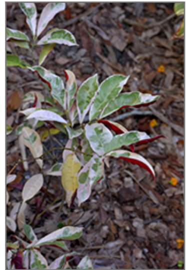
Firestorm Chinese Croton foliage