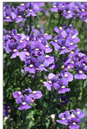
Nesia Denim Nemesia flowers

Nesia Denim Nemesia is recommended for the following landscape applications;