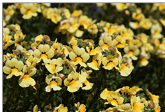
Nesia Inca Nemesia flowers