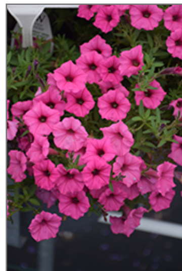
Supertunia Mini Vista Hot Pink Petunia flowers

Supertunia Mini Vista Hot Pink Petunia is recommended for the following landscape applications;