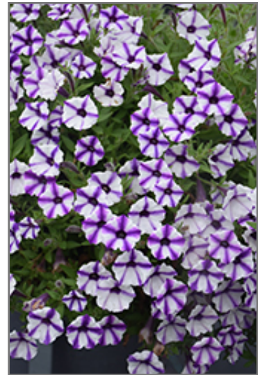
Supertunia Mini Vista Violet Star Petunia flowers

Supertunia Mini Vista Violet Star Petunia is a dense herbaceous annual with a trailing habit of growth, eventually spilling over the edges of hanging baskets and containers. Its medium texture blends into the garden, but can always be balanced by a couple of finer or coarser plants for an effective composition.