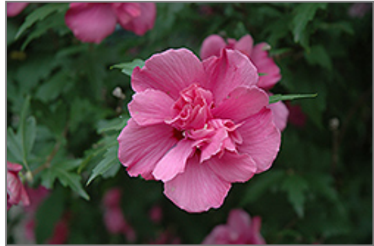
Lucy Rose Of Sharon flowers

Lucy Rose Of Sharon is recommended for the following landscape applications;