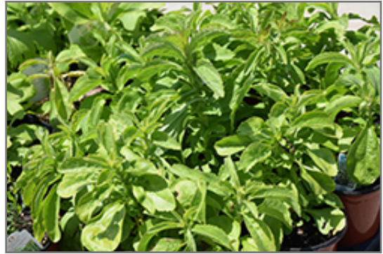
Sugar Love Stevia

Sugar Love Stevia will grow to be about 3 feet tall at maturity, with a spread of 3 feet. It tends to be leggy, with a typical clearance of 1 foot from the ground, and should be underplanted with lower-growing perennials. Although it's not a true annual, this plant can be expected to behave as an annual in our climate if left outdoors over the winter, usually needing replacement the following year. As such, gardeners should take into consideration that it will perform differently than it would in its native habitat.