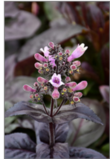
Dakota Burgundy Beard Tongue flowers

Dakota Burgundy Beard Tongue is an herbaceous perennial with an upright spreading habit of growth. Its medium texture blends into the garden, but can always be balanced by a couple of finer or coarser plants for an effective composition.