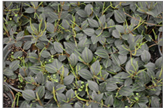
Raydiance Peperomia foliage

When grown indoors, Raydiance Peperomia can be expected to grow to be about 10 inches tall at maturity, with a spread of 18 inches. It grows at a medium rate, and under ideal conditions can be expected to live for approximately 5 years. This houseplant performs well in both bright or indirect sunlight and strong artificial light, and can therefore be situated in almost any well-lit room or location. It does best in average to evenly moist soil, but will not tolerate standing water. The surface of the soil shouldn't be allowed to dry out completely, and so you should expect to water this plant once and possibly even twice each week. Be aware that your particular watering schedule may vary depending on its location in the room, the pot size, plant size and other conditions; if in doubt, ask one of our experts in the store for advice. It will benefit from a regular feeding with a general-purpose fertilizer with every second or third watering. It is not particular as to soil pH, but grows best in rich soil. Contact the store for specific recommendations on pre-mixed potting soil for this plant.