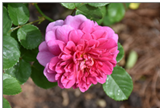
Zephirine Drouhin Climbing Rose flowers