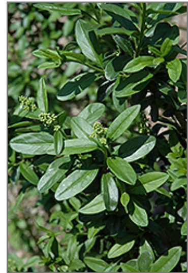
California Privet foliage