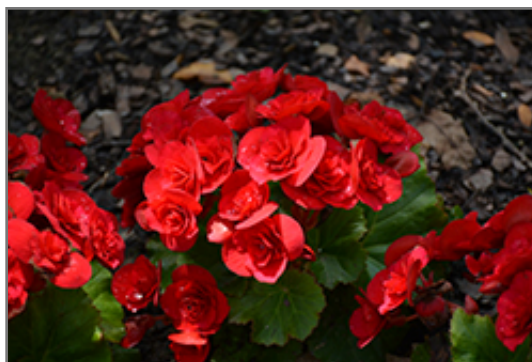
Move2 Passion Red Begonia flowers

Move2 Passion Red Begonia is recommended for the following landscape applications;