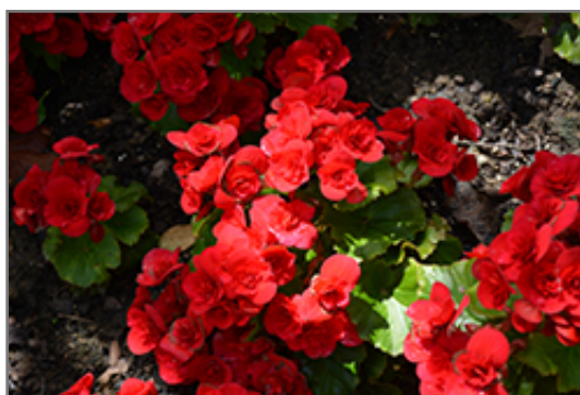
Move2 Passion Red Begonia in bloom