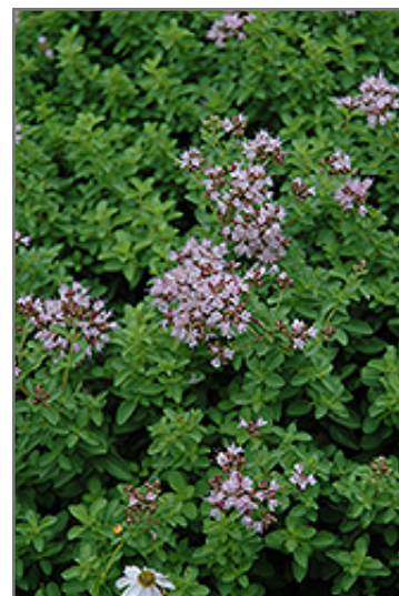
Dwarf Oregano flowers

Aside from its primary use as an edible, Dwarf Oregano is suitable for the following landscape applications;