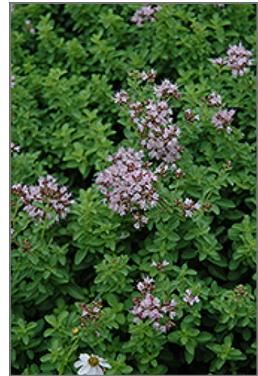
Dwarf Oregano flowers

Aside from its primary use as an edible, Dwarf Oregano is suitable for the following landscape applications;