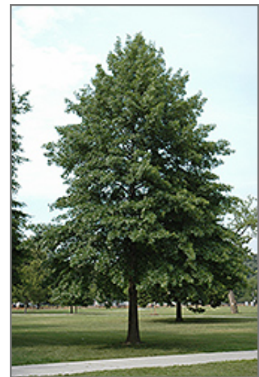
Pin Oak