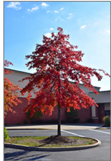
Pin Oak in fall

Pin Oak is recommended for the following landscape applications;